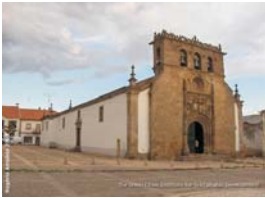
Cathedral of Foz Côa

22:30 - Bus connection to accommodations outside town.