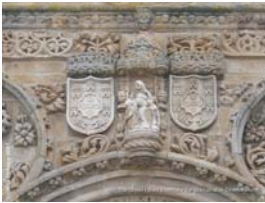
Facade's detail of the Cathedral of Vila Nova de Foz Côa