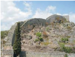
Castle of Numão