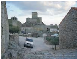
Castle of Marialva

remain, today, as impressive monuments. From the Middle Age some examples of sacred art are to be found in ancient churches and chapels, remodelled and rebuild over the centuries, but that kept some of the original structure.