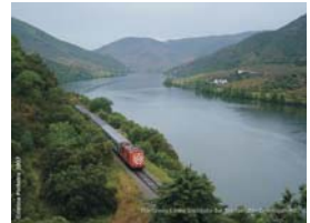
Train crossing the landscape