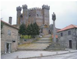
Castle of Penedono

14:00 - Visiting Medieval Castles and villages.