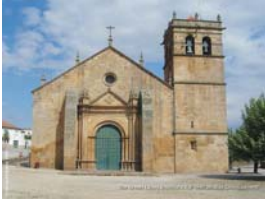
Cathedral of Almendra