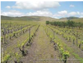
Vineyard at Ervamoira

the best way. A special kind of boats (the “rabelos”) was developed for that purpose. They are long, with only one sail; the job of making them come safely down the river was not an easy one and accidents occurred in especially difficult passages, as “Valeira” for example. Going back up river was not a lighter job: boats had to be pulled by cows, marching on special paths on the river banks, during long parts of their journey east. Presently, the wine no longer sails down the river, the “rabelos” being only a symbol of the old times and a touristy attraction.