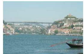
Porto and Vila Nova de Gaia

Note: The Conference's Programmes are still subject to changes.