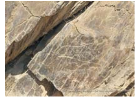
Rock engraving of an aurochs