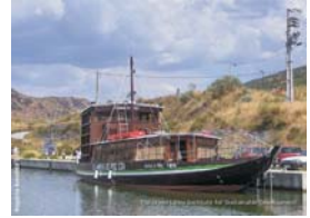
Rabelo boat at Pocinho

08:30 - Opening of Registration Desk. Bus connection from accommodations outside town to Vila Nova de Foz Côa. 10:00 - Visit to Quinta de Ervamoira (vineyard and museum). 12:30 - Light lunch. 14:00 - Visit to Archaeological Park of Foz Côa Valley and boat trip along River Douro. 19:00 - Bus connection to accommodations outside town. 22:00 - Bus connection to accommodations outside town.