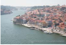
Porto and River Douro