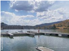
Dam and quay of Pocinho