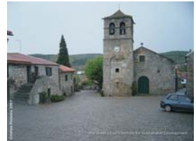
Cathedral of Freixo de Numão