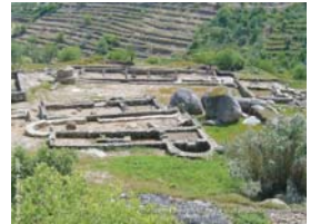
Roman Villa at Prazo