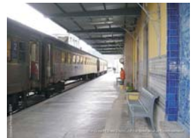
Train Station of Pocinho

08:30 - Bus connection from accommodations outside town to Vila Nova de Foz Côa. 09:30 - Luggage check in. 10:00 - Departure from Vila Nova de Foz Côa to Régua. 13:00 - Gala lunch. 15:00 - Departure to Porto. 17:00 - Visit to Port Wine cellars at Vila Nova de Gaia.