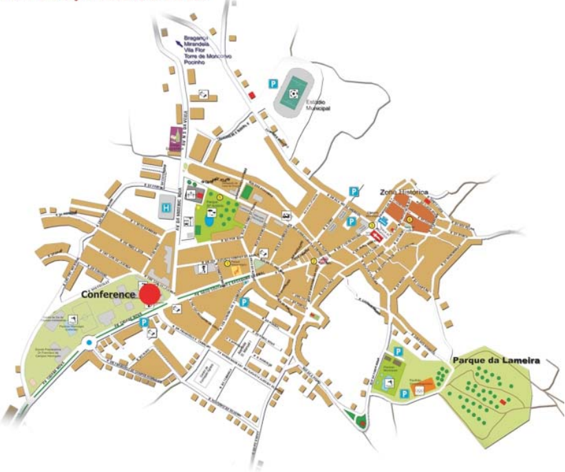
1-Headquarters of the Archaeological Park 2- Tablado Square 3- Main Square 4- Historic District 5- Santo António Park