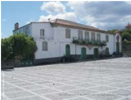
Palace at Muxagata

22:00 - Bus connection to accommodations outside town.