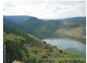
Landscape of Douro